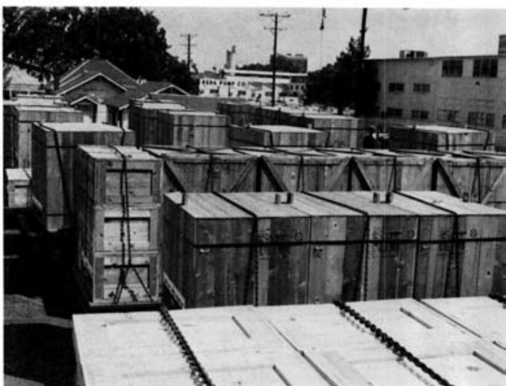
Crate after crate of Reda Pumps are made ready for shipment to the Port of Houston for Indonesian oil fields.