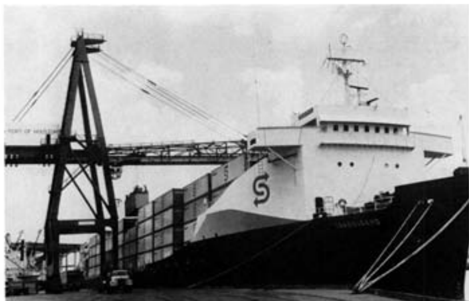
The container vessel, M/V TRANSIDAHO, shown here working at the Port of Houston's new container crane, has the largest container capacity of any ship to call at the nation's third largest port. The Seatrain Lines, Inc.'s liner, while in Houston, handled more than 700 40-foot containers, of which some 150 were drayed from New Orleans.