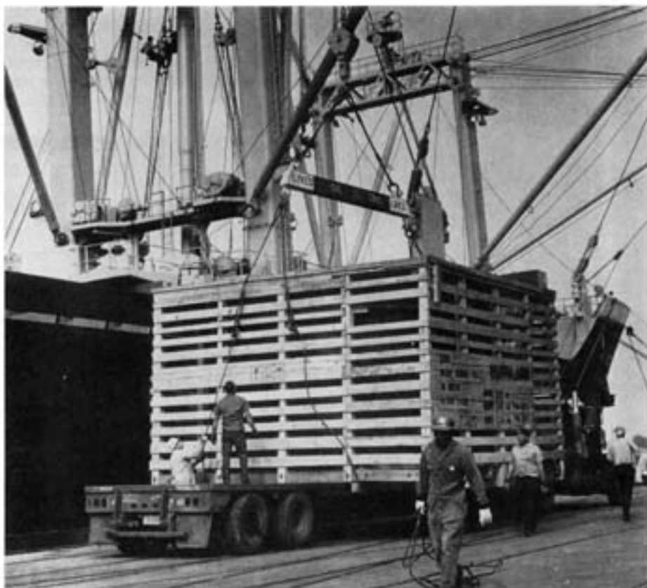
Lykes Bros. Steamship Company's 5/5 SOLOM TURMAN recently brought into the Port of Houston nine truckloads of brewery equipment from the Netherlands destined for the Coors Brewing Company plant in Golden, Colorado. Shown in this photo is a giant crated brewing vat as it is inched onto one of the J. J. Willis Truckline vehicles which carried the massive equipment on the final leg of its journey. A. J. Fritz and Company were foreign freight forwarders and customs brokers for the shipment.

Houston - Galveston - Mobile Memphis-New Orleans-Dallas Chicago - Atlanta - St. Louis Charleston - Greenville